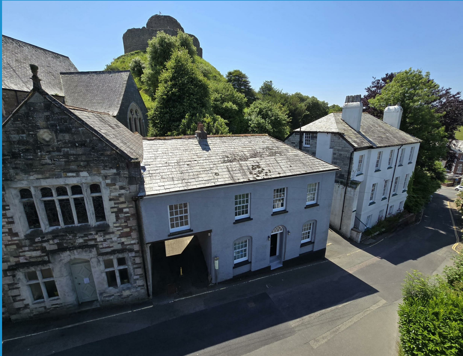
Castle Street Launceston | Cornwall